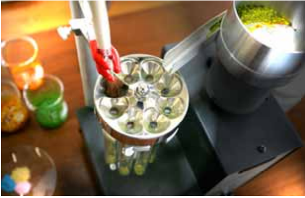
Figure 2: Spinning riffler

For ease of comparison, a summary of the advantages and disadvantages of each sampling technique is given in table I.